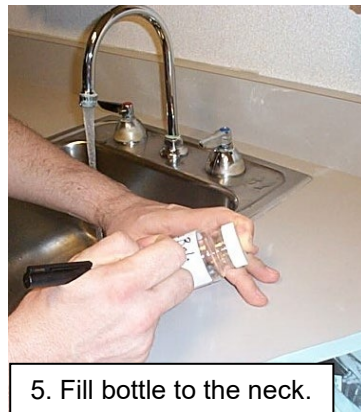
5. Fill bottle to the neck.