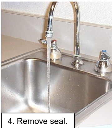
4. Remove seal.