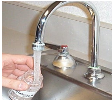
2. Run cold water for 2-4 min.